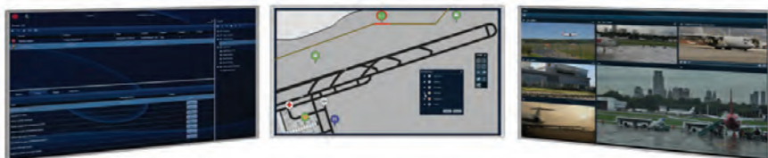
Fortis 4G - Advanced PSIM